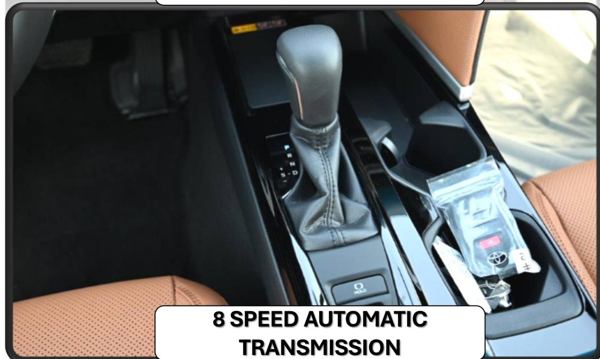
8 SPEED AUTOMATIC TRANSMISSION