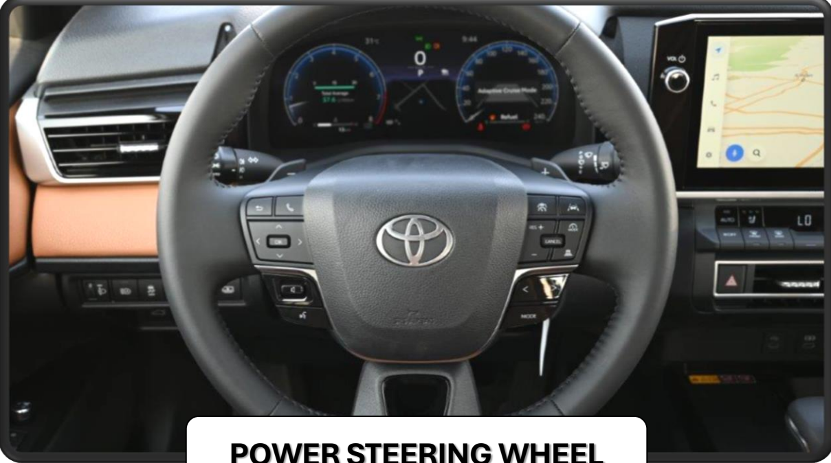
POWER STEERING WHEEL